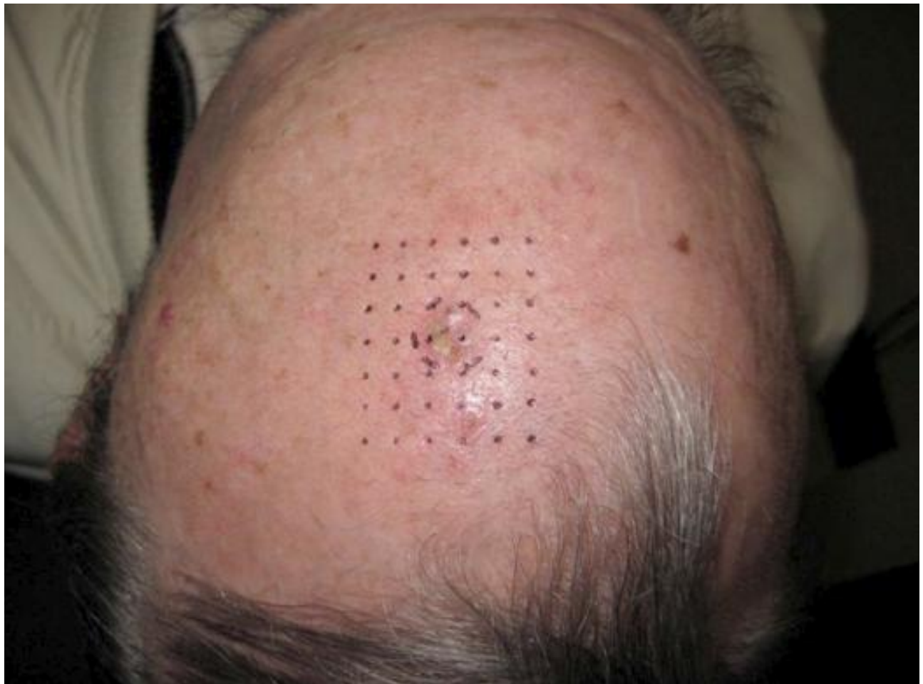
Fig. 1.: The skin site with grid marked by dots, and central BCC.