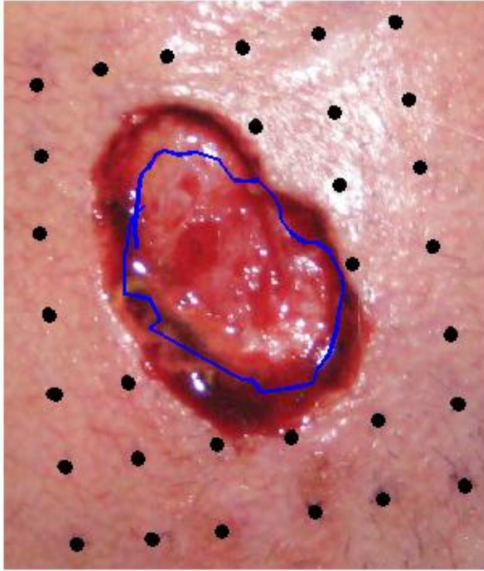
Fig. 5. The excised skin site, with the blue line of the cancer margin from Fig. 4 based on the \Delta POL image. The dots have been redrawn by the computer to improve legibility in this report.