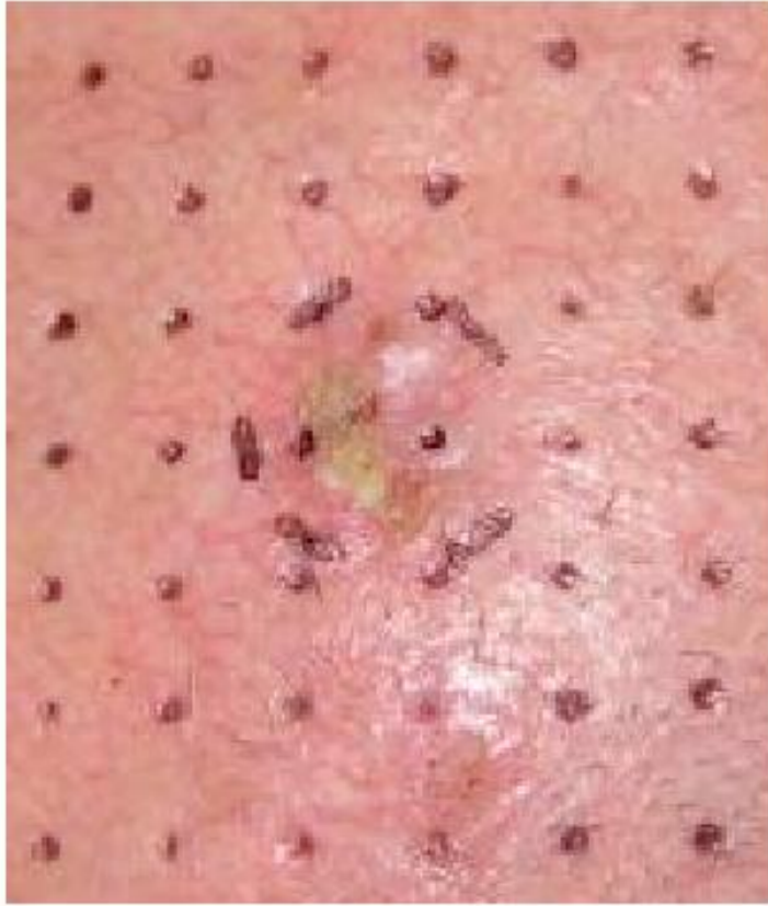
Fig. 2. Close up of preliminary clinical image of BCC, with dots from grid and dashed lines by doctor showing clinical margin.