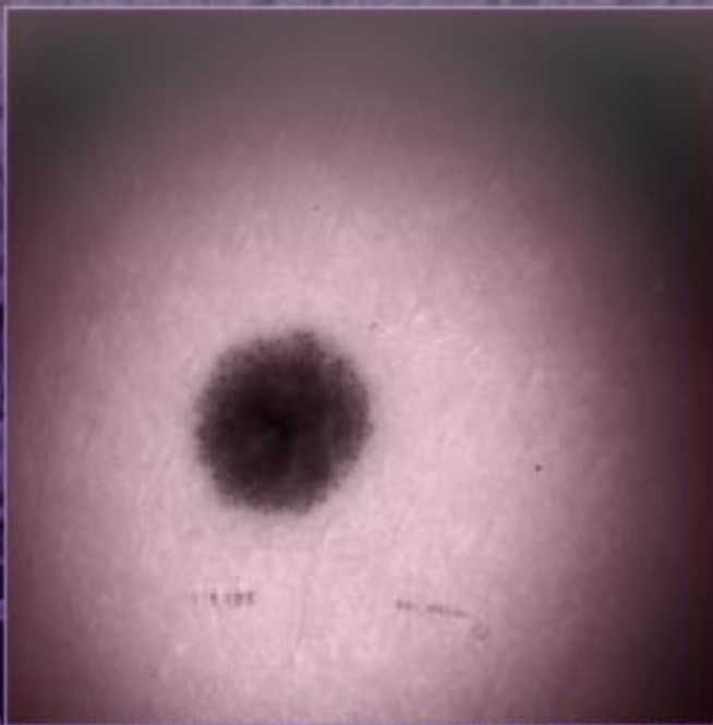
Normal light image.